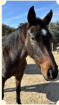
Only with You