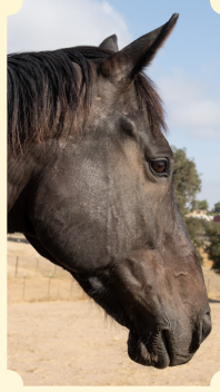
Gambler's Gold Rush